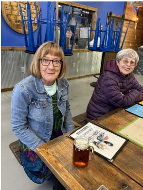
“Out to Lunch Bunch” October 15

November 17, 2024 is Thankoffering Sunday. This is the time to give thanks for all the blessings we have received as individuals, as families and as a nation. The Women of First Lutheran will be participating in the church service on this day. This is also an opportunity to give a new blanket, that will go with the quilts made by Dorcas Sewing Circle, to Lutheran World Relief. The blanket you bring can be put in the front of the church by the altar. There will be Thankoffering envelopes in the pews so you can make a special donation to FLCW missions.